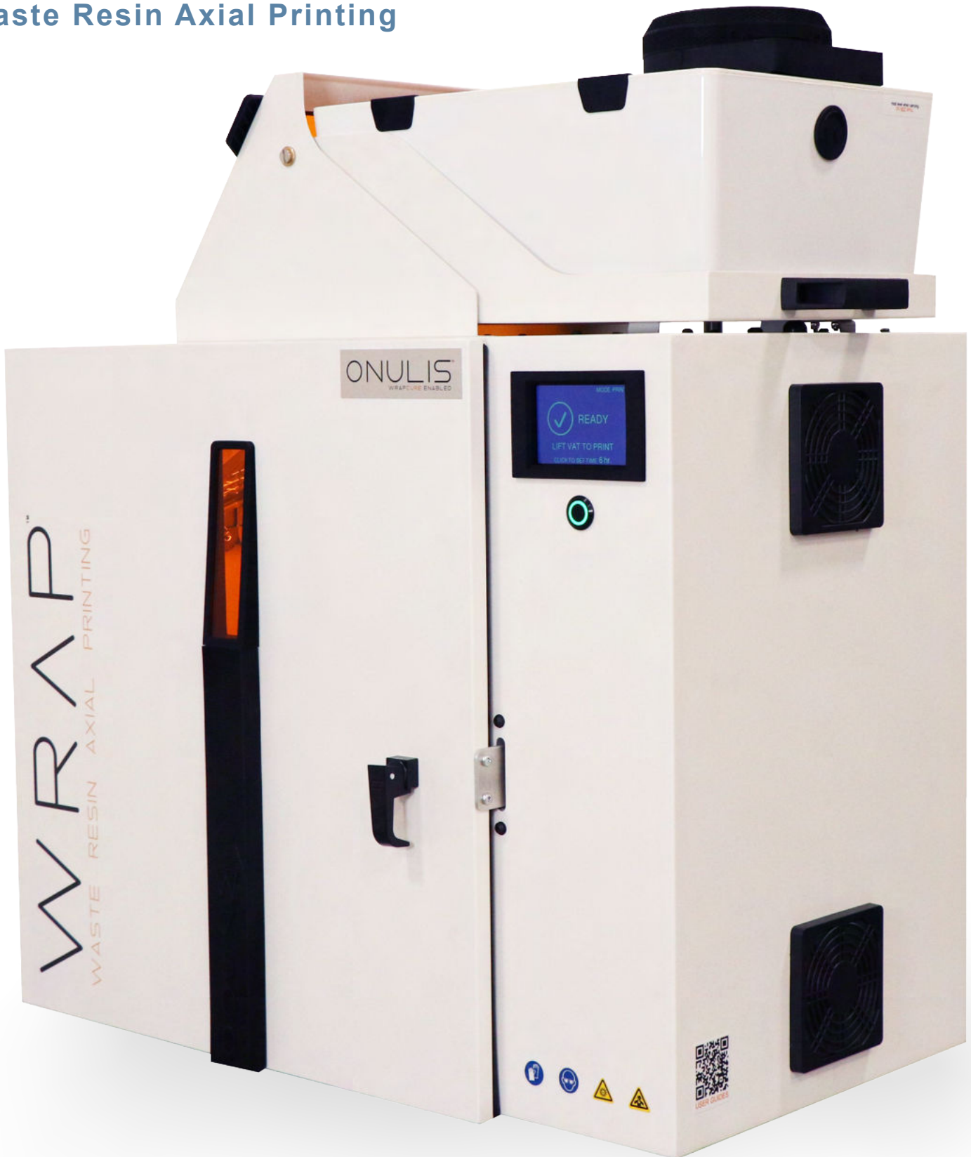
Optional WRAPCure Production DLP Curing Module Pictured Above